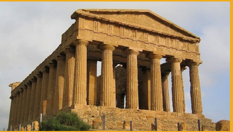
Temple of Concordia – Agrigento, Italy.

While a flexible schedule, eating out at 8:00 pm and celebrating local holidays may seem like a leisure trip, it reinforced critical components of leadership development.