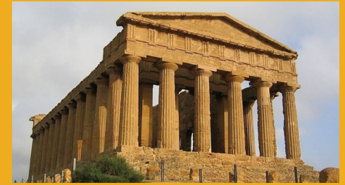
Temple of Concordia – Agrigento, Italy.

While a flexible schedule, eating out at 8:00 pm and celebrating local holidays may seem like a leisure trip, it reinforced critical components of leadership development.