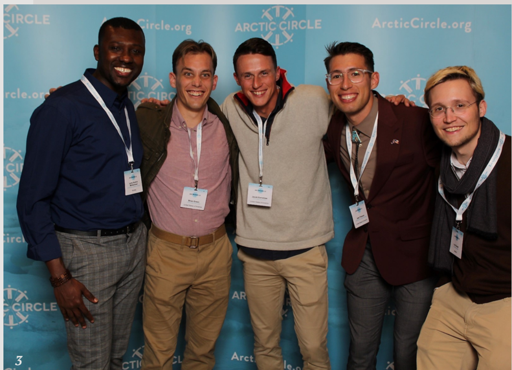
Figure 3 Attending the Young Arctic Leaders social event and meeting students from Norway and Germany